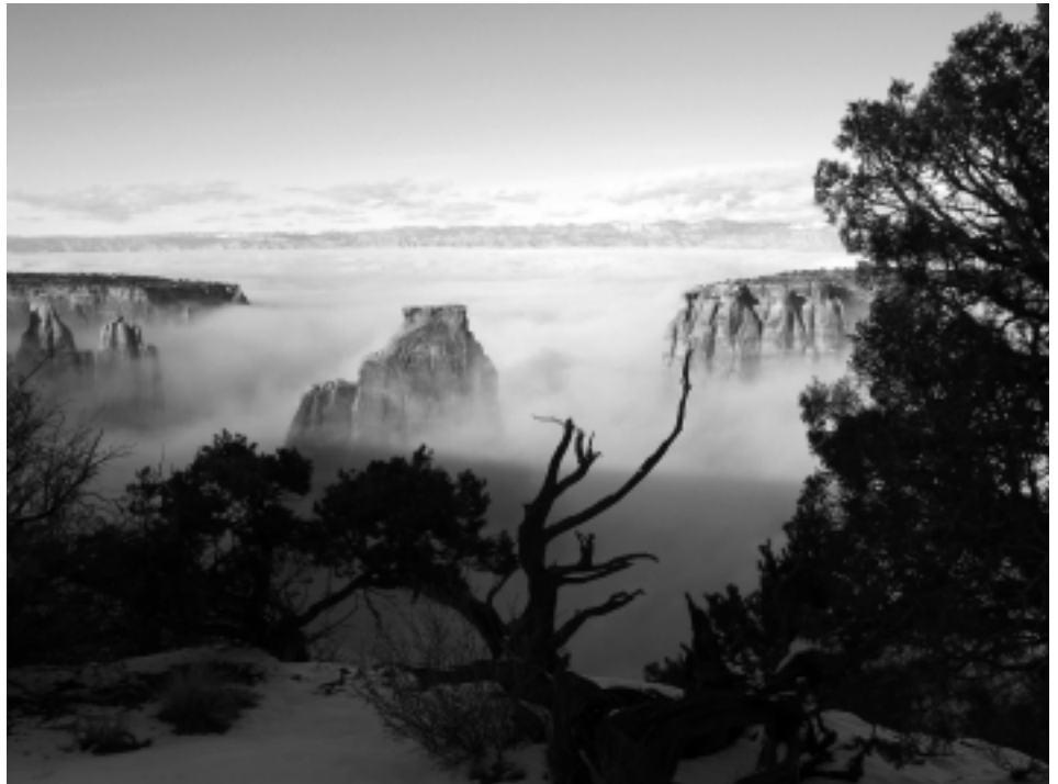
It was "one of those foggy winter days," says Walt Fite, that inspired him to drive to the top of the Monument and snap this award-winning photo.

Each year, a series of collectible Passport stamps is issued. There are ten stamps in the series, nine regional and one national stamp. The stamps are issued on a single sheet, and once purchased, can be placed in the designated areas of the Passport book. A photography contest is held each year to determine which parks will be represented in the stamps. Photographers must be NPS employees or volunteers to be eligible. For the first time since the stamps were introduced, a photograph of Colorado National